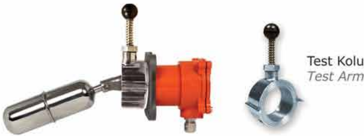
F1 Test Kollu F1 with Test Arm

F1 ile Karşı Flanş arasında monte edilebilen test cihazı ile F1 Seviye Şalteri' ni sökme veya tankı doldurma - boşaltma işlemini yapmaya gerek kalmadan, çalışma testi yapılabilir.