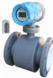
INFRARED CONTROL /EMD-IC..